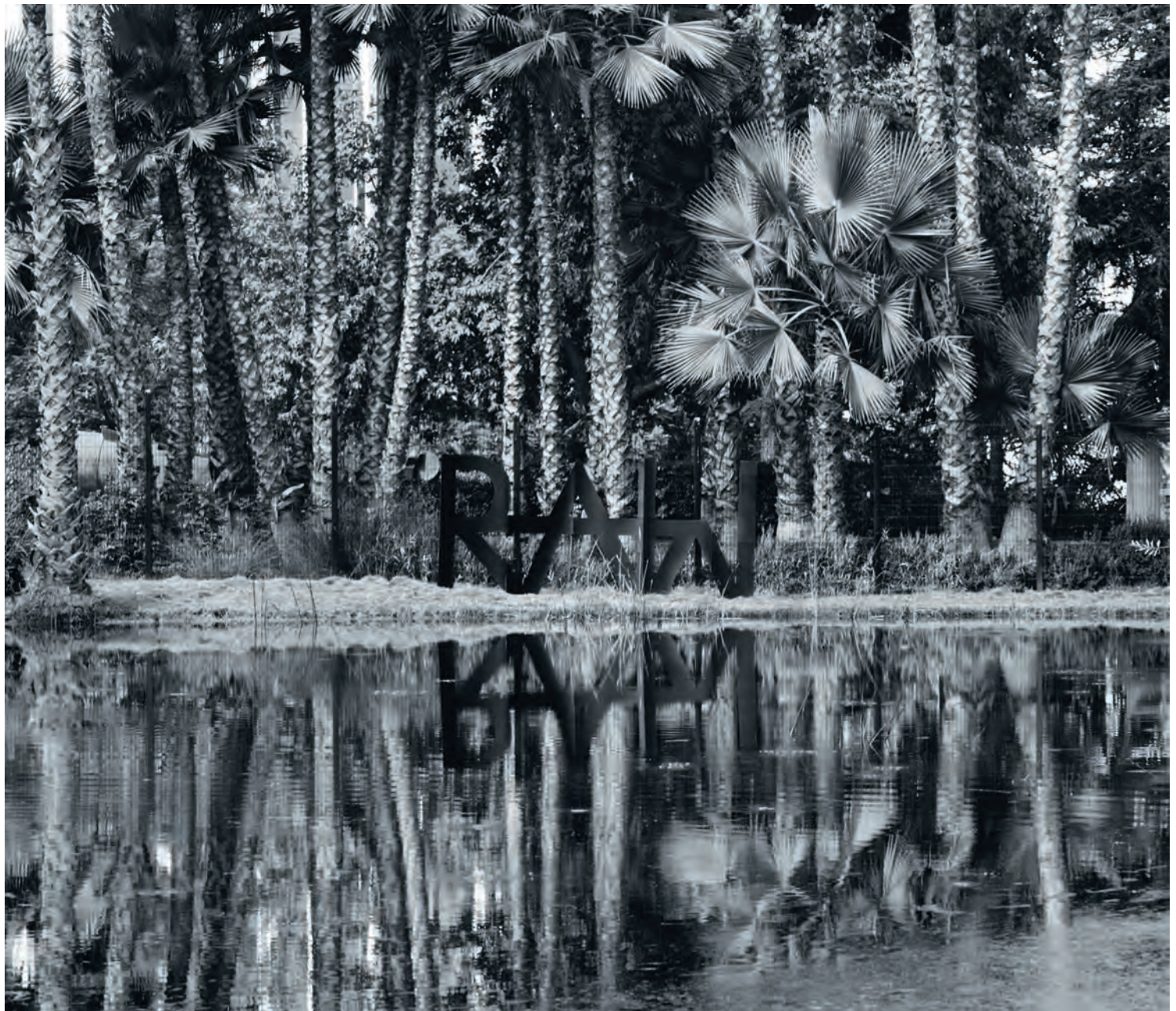
Below: Leaf and Strike 2009 C-type print 20×31 cm