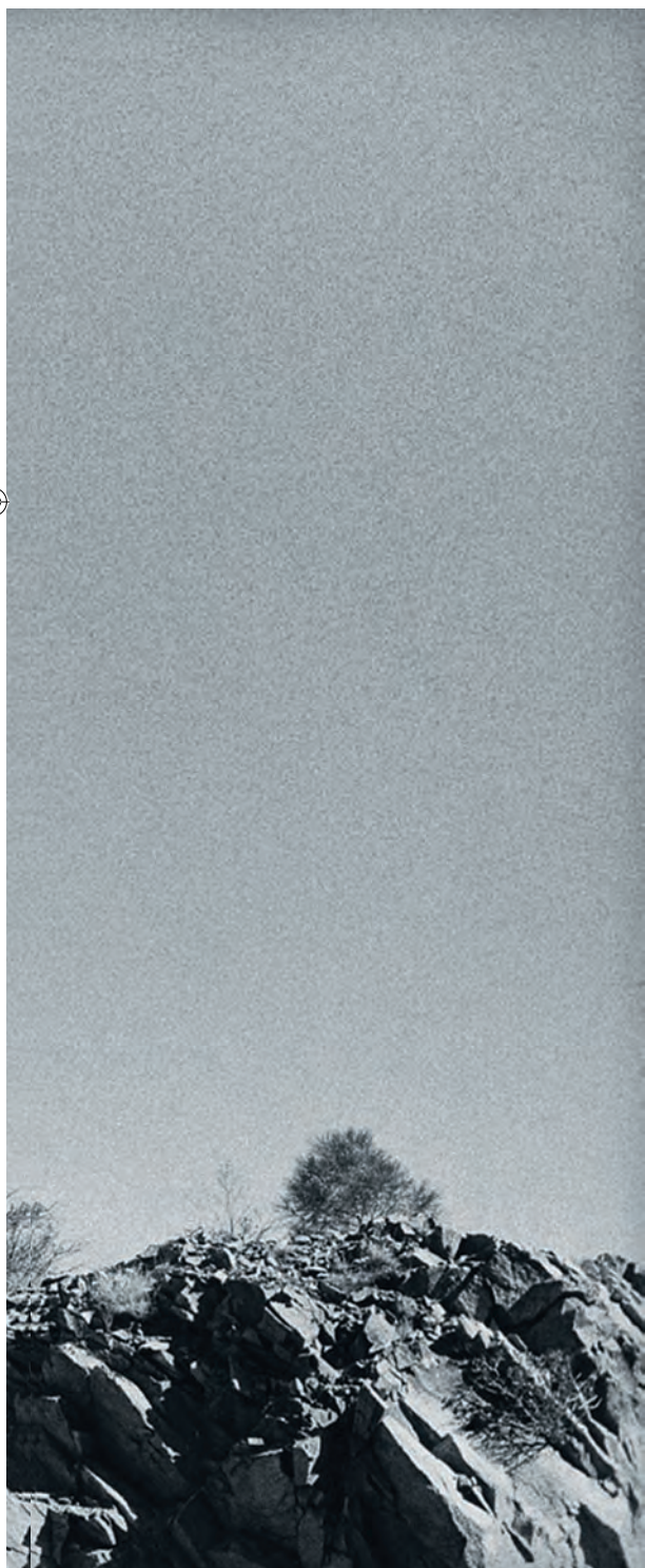
Below left: Leaning Tree 2002/8 C-type print 75×112 cm