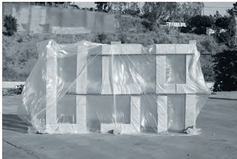
Left: Sbrouded Monument 2008 C-type print 103×123 cm