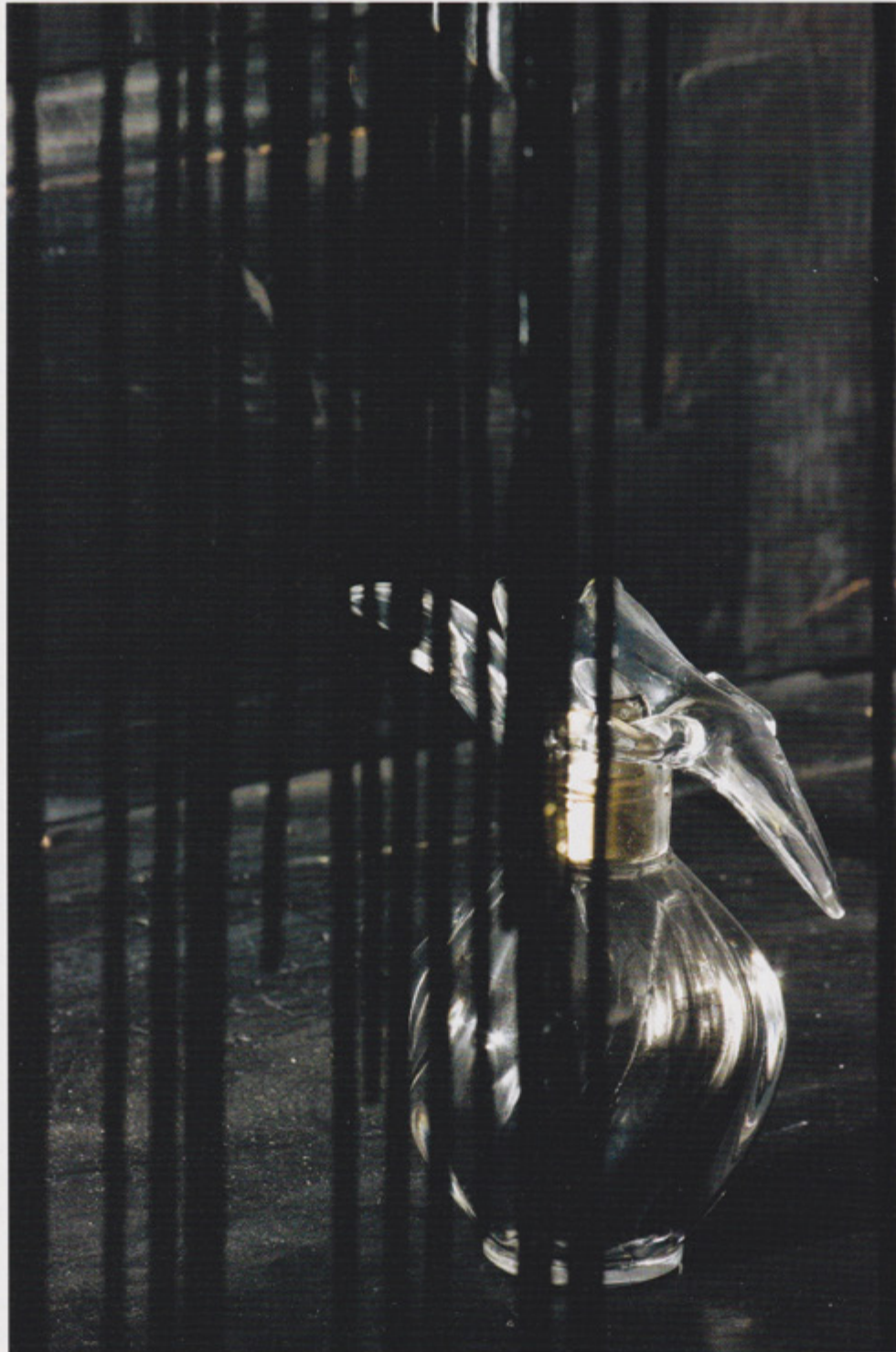
L'Air du Temps, 2014 (installation view, Cabinet of Curiosities, Cathedral Museum of Salzburg).

her schooltime career in sports, between the ages of fourteen and seventeen, when Jesse Owens was a role model, "because he was even more than an African-American athlete, he ran and won at the 1936 Berlin Olympics, he had a real political impact". Later, as a freshman at the École Supérieure d'Art in Grenoble, she joined the Mouvement des Jeunes Communistes de France (MJCF), a political youth organisation close to the French communist party, only to realise subsequently that it wasn't open enough for her really to commit to it.