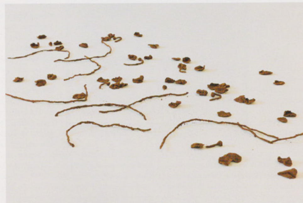
Charlie Brown's Poppies , 2011 (installation view, Beirut Art Center, 2011), red soil and clay from Beirut, dimensions variable. Photo: Agop Kanledjian

all works Courtesy the artist and Galerie Kamel Mennour, Paris