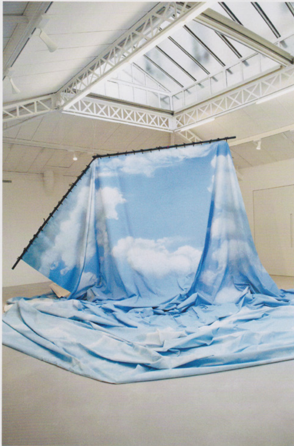
above La Dépossession , 2014 (installation view, Galerie Kamel Mennour, Paris, 2014), theatre canvas, paint, steel tube and straps, variable dimensions.