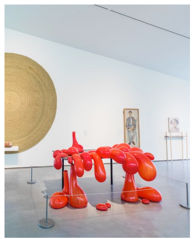
Hamilton's "Volcano Table," 2014, is made from blown glass, Ferrari-red pigment, limestone tiles and powder-coated metal, and is seen here alongside a series of handwoven grass mats that she created as part of the "Anthea Hamilton Reimagines Kettle's Yard" exhibition.

Hamilton: Yes. You can feel comfortable in there. It makes you feel like you're at home. But it's a universe of its own logic.