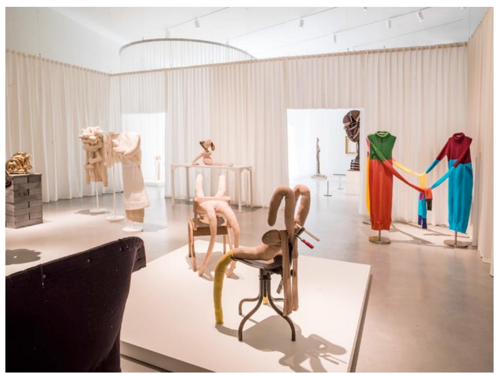
Works by the artists Sarah Lucas and Hans Bellmer sit alongside clothing by J.W. Anderson in "Disobedient Bodies." This room is titled "Soft Bodies. Desiring Monsters."

Each of the four gallery rooms have an intimate, warrenlike feel thanks to a series of curtain partitions, conceived by 6a Architects, some featuring fabrics from Anderson's own archive — including a cutesy bunny-print corduroy. There are further playful touches, including 28 elongated jumpers suspended from the ceiling that visitors are invited to touch, feel and mess around with.