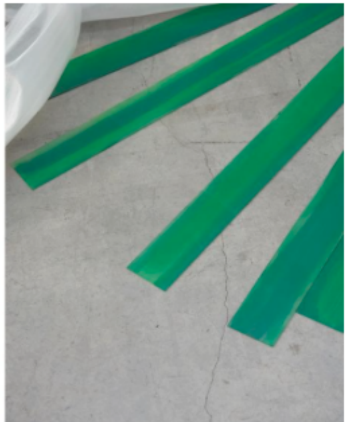
Artificial palm tree leaves derive from PET polymers, obtained from the plastic waste used in Marni's S/S 2020 men's show