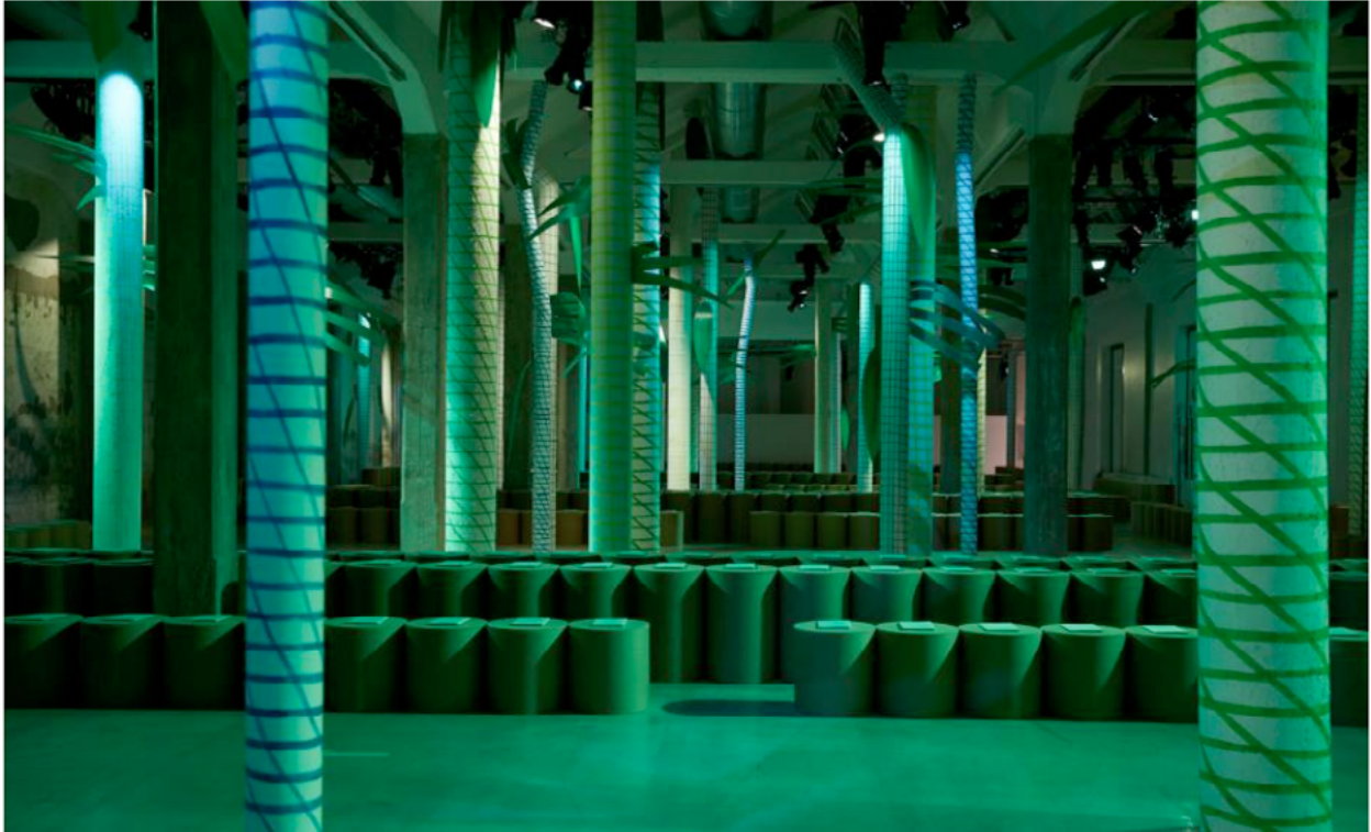
Marni show set S/S 2020 designed by artist Judith Hopf

The Italian house's sustainably-minded set design speaks of promise, of things discarded, reused and transformed