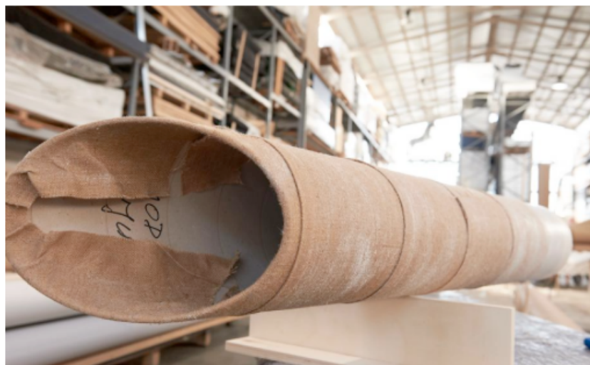
The making process behind 'Act 2', artist Judith Hopf's palm tree-lined show set for Marni's S/S 2020 women's show