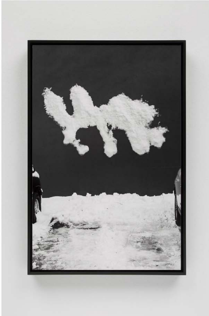
Shannon Ebner, SNOW DRIFT , 2022, archival pigment print mounted on aluminium, 55 × 37 cm.

A suite of black and white photographs on the surrounding walls adjacent to FRET compliment its poetic language, picturing different objects and text-based signage: images often taken through (or capturing what is reflected from) storefront windows – each element of these pictures a subject in itself, asking us to reanimate the way we look at something. For instance, two matte photographs mounted on aluminum are experimental plays on New York City street photography: Timbuk2 (2022), in which a window sign for a sample sale is transmogrified by tender scrutiny into a nuanced, hyper-dimensional object; and Commercial Place (2022), an image of a rolling gate that creates a phantom grid against an everyday street scene.