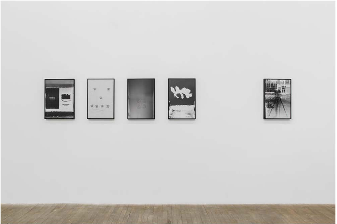
Shannon Ebner, 'FRET SCAPES', 2022, installation view.

The centrepiece of the exhibition – a work which Ebner describes as the ‘weather event’ in the show’s press release – is FRET (2021), a visual poem made up of 17 box-form stanzas that covers most of one large wall. The work uses Ebner’s ‘Wet Letter’ alphabet, a typographic construction that Ebner first introduced in her 2019 show ‘WET WORDS IN A HOT FIELD’ at Altman Siegel in San Francisco. Ebner takes a set of hand-size letter cutouts and then uses only water to paste them to the wall. She then has to race against the clock to photograph the letters before each sheet dries up and begins to peel away or actually fall to the ground, with the photographs then being arranged into groups to form words, with the results rephotographed and fixed to the wall as set of single sheets. In this process, the artist has created something akin to a FRET system: her field of letters diagram her attempts to measure and document an amount of moisture, as well as a language, that is fast disappearing. Taken as a whole, the letters of the ‘Wet Letter’ alphabet look like leaves of newsprint with flat, standardised typography. But on closer inspection, we can see the delicate labour that has created each letter-object: faint water drips underlining a ‘G’ or a blurred hand obscuring a ‘V’ – each one carrying a message about its own making.