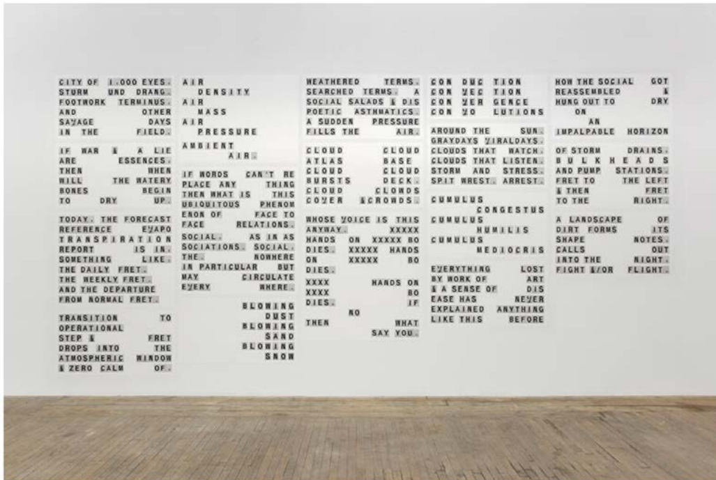
Shannon Ebner, FRET , 2022, archival pigment print on Photo Tex, 2.9 × 6 m. Courtesy: © the artist and kaufmann repetto Milan / New York; photograph: Greg Carideo

Other photographs, such as Campaign (2022) – an image of two Manual Photo ads wheatpasted onto a construction site wall – harken back to the affixing gesture of FRET , the typographic style of which, on second viewing, recalls the the ever-changing menu board in a traditional American diner, or a pre-digital arrivals/departures board in a train station. This concrete poem is a forecast in form and content, prognosticating states of unrest and agitation with phrases such as ‘Sturm und Drang’, ‘Zero Calm’, and ‘Fret to the left and fret to the right.’ Still, there’s a sense of alternative possibilities here – a chance to look closer and change direction. One photograph, Non Ideae Sed In Rebus (2021), which distinguishes itself from the others by being rectangular in format, seems to connect all the works in spirit, relaying a literal phrase engraved into the sidewalk that reads: ‘To writing in the forever wet cement of good worlds to come.’