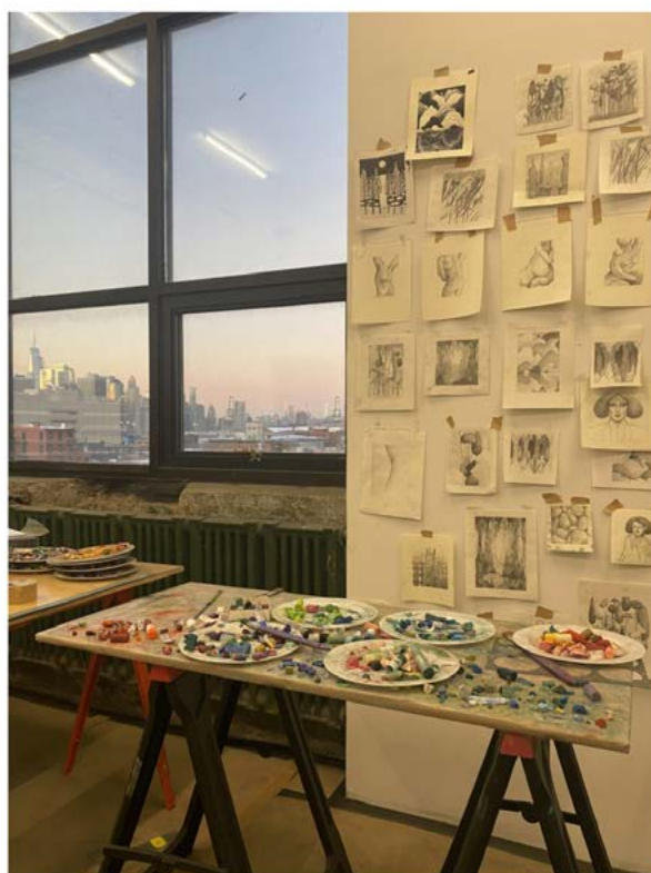
Nicolas Party's studio.

Is there a picture you can send of your work in progress?