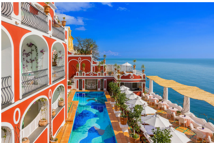
The pool terrace.