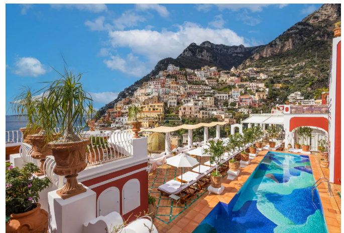
Views of the Amalfi Coast beyond.