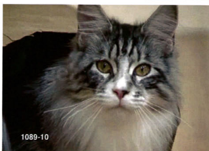
Top images: MARTIN KOHOUT, Watching Martin Kohout , 2011. YouTube channel. Bottom images: ALEKSANDRA DOMANOVIC, Anhedonia , 2007. Video, DVD, PAL, 90 mins.

as material to be used by others in their own work, the only condition being inclusion into Fritsch's collection. Explicitly addressing his audience as prosumers, Fritsch's détournement of Depeche Mode's album title Music for the Masses (1987) captures spot-on the shift from consumption to prosumption .