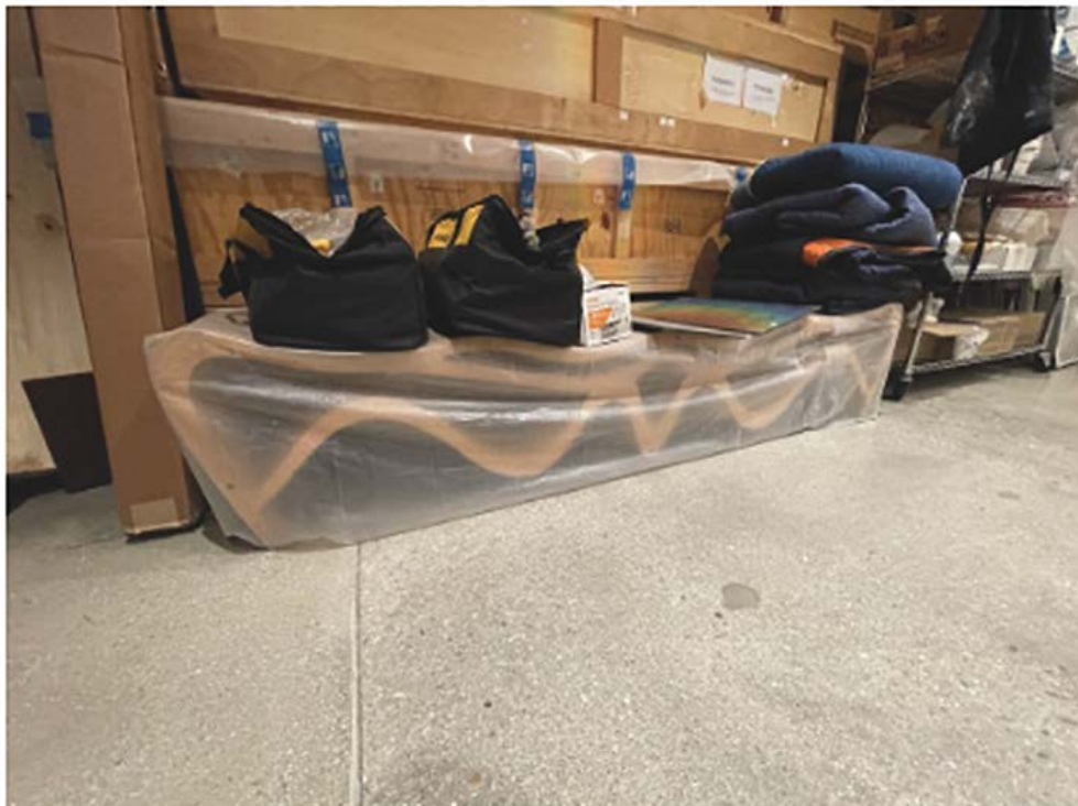
A Jorge Pardo bench in Pae White's studio.

I don't think his team wanted to see more of his work than they were already seeing on a daily basis, so they never would buy the $5 tickets. All it would take was $20 to virtually guarantee the win. Eventually I stopped buying tickets because it wasn't fair that I would win every year!