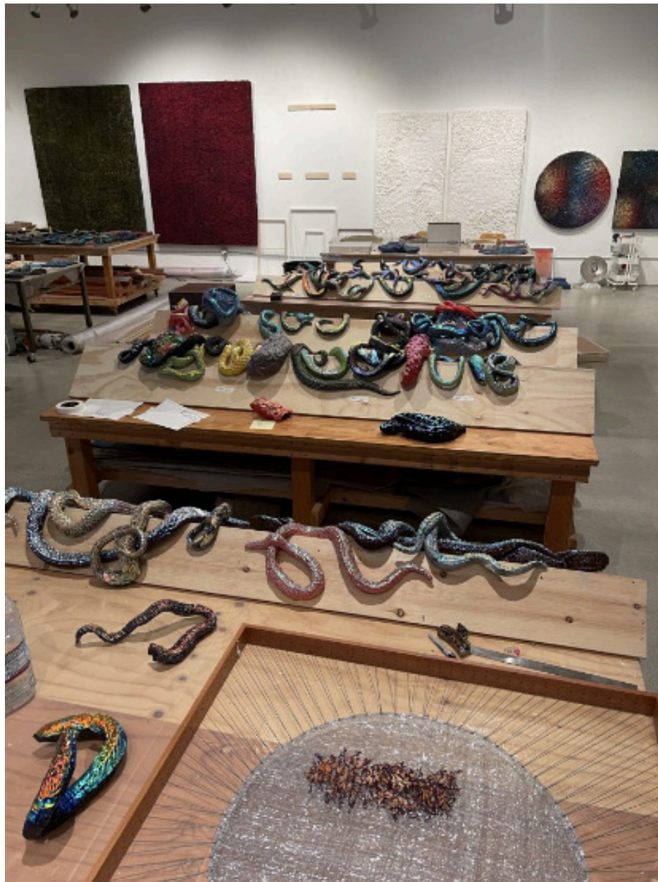
Pae White's work in her studio.