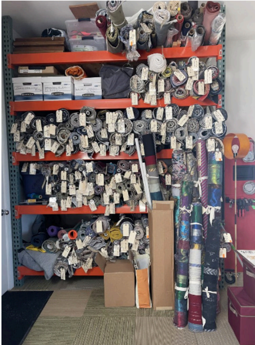
Pae White's studio.