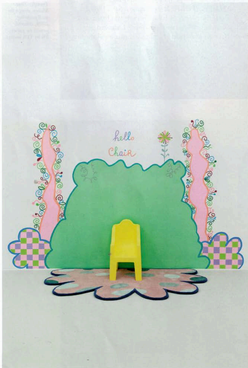
Hello Chair, 2014, acrylic paint on wall and mixed mediums, 65¼ by 103½ by 30 inches, at Air de Paris.

rectangle of the page, in going around corners and filling up someone else's private space. Then, when I began making them in galleries, in 1989, I discovered an even more potent consequence: the significance of taking intimate thoughts into the public arena and blowing them up for the world to see. There is so much in our lives that we keep hidden from one another—problems with family, money, work and relationships—and these secrets and concerns almost never show up in artworks. Turning my small drawings into giant wall paintings has a certain magic, and is quite liberating.