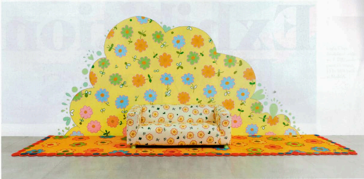
Dreaming makes the world go forward, 2010, acrylic paint on wall and mixed mediums, 94½ by 221¼ by 47½ inches, at Tate St Ives.

STILLMAN My guess is those viewers missed the crucial element of masquerade in your work: it appropriates the visual appearance of a teenager's doodles to raise adult questions.