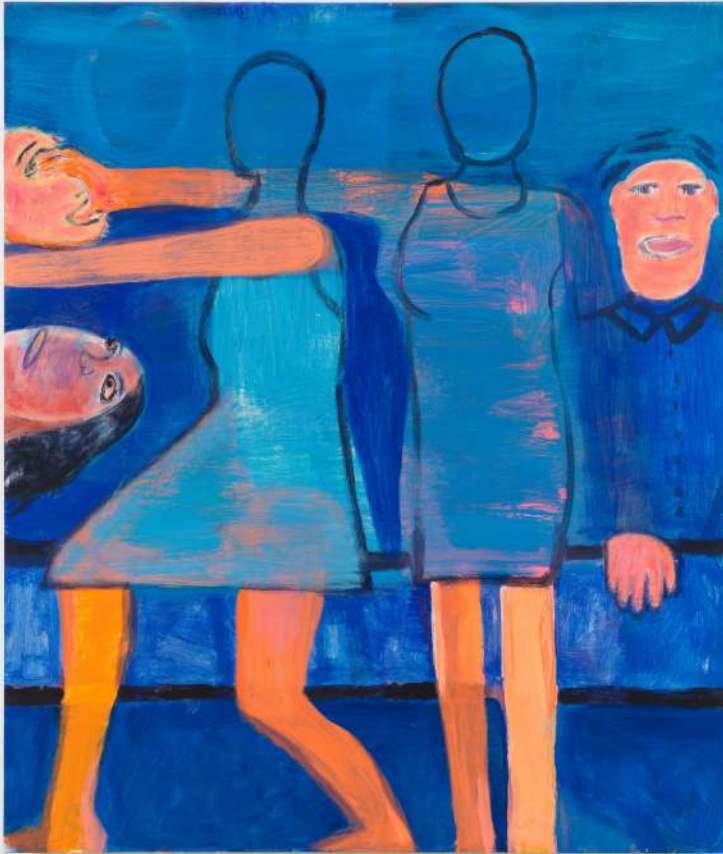
Katherine Bradford, Choice of Heads, 2019. Acrylic on canvas. 80 x 68 inches. Courtesy of the artist and Campoli Presti, London / Paris

stripes and legs dividing the canvas in a Rothko-style, color field-type reference.