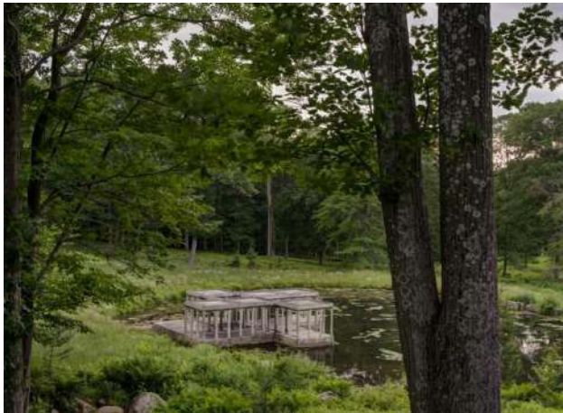
Pavilion in the Pond, 1962, at the Glass House.