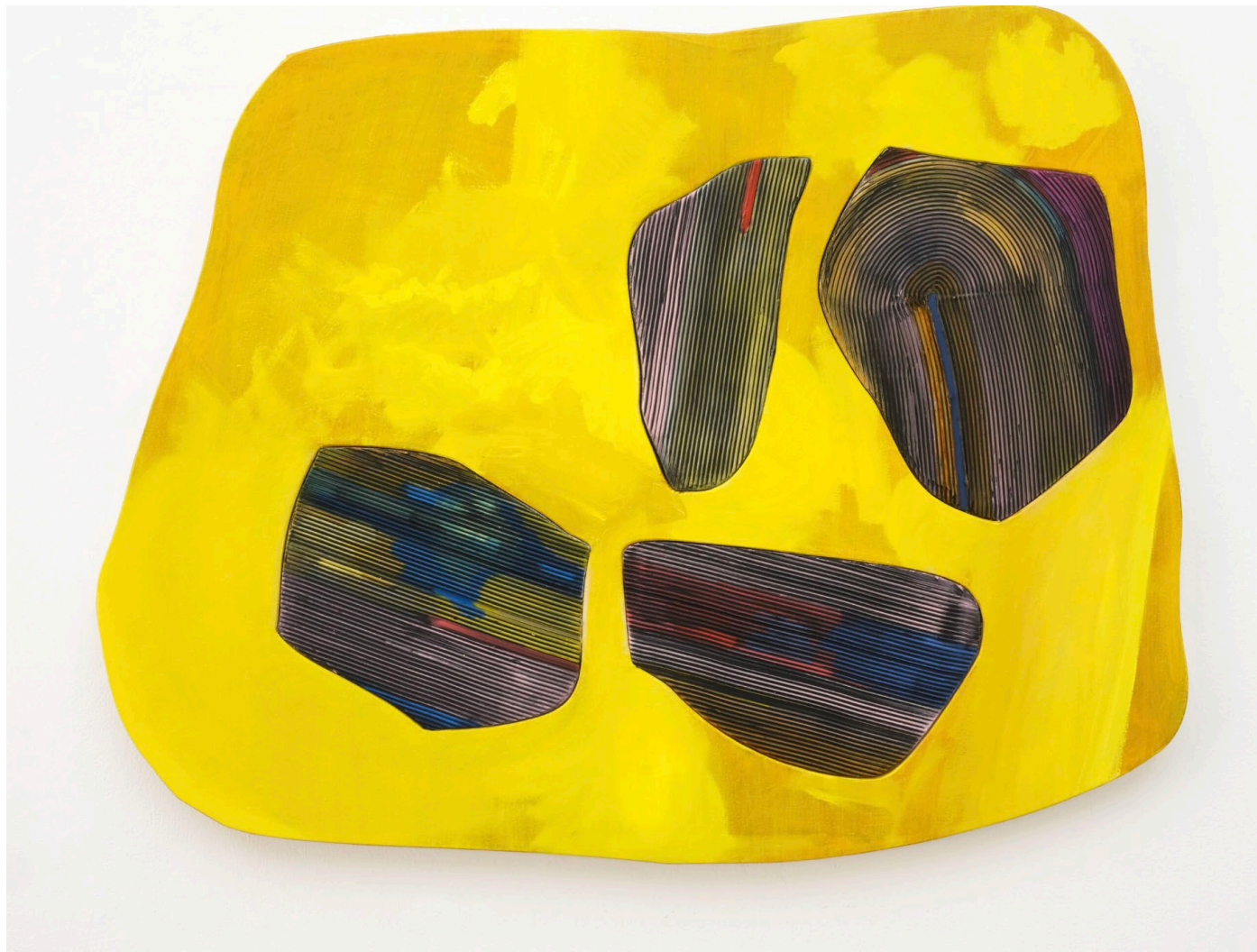
Leslie Smith III, The Stillness Between Breaths , 2025.

I keep returning to see these paintings. They don't make a show of technical virtuosity nor do they rifle through the archive of art history in a performative way. Bradford's canvases instead simply convey a deep devotion to the act of painting itself, one that remains distinctly personal, unresolved, and ongoing.