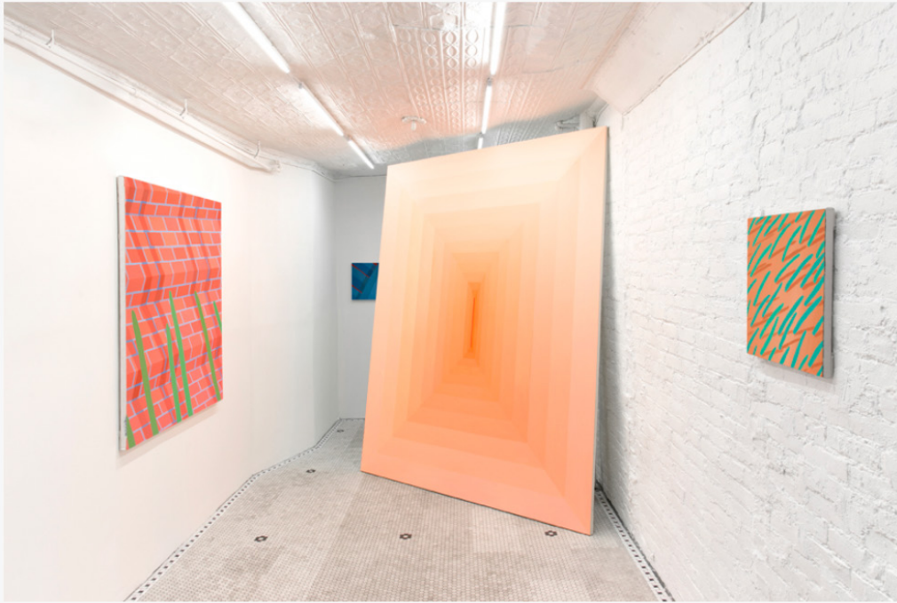
Installation view of Dwell at MILLER in NYC, 2016.