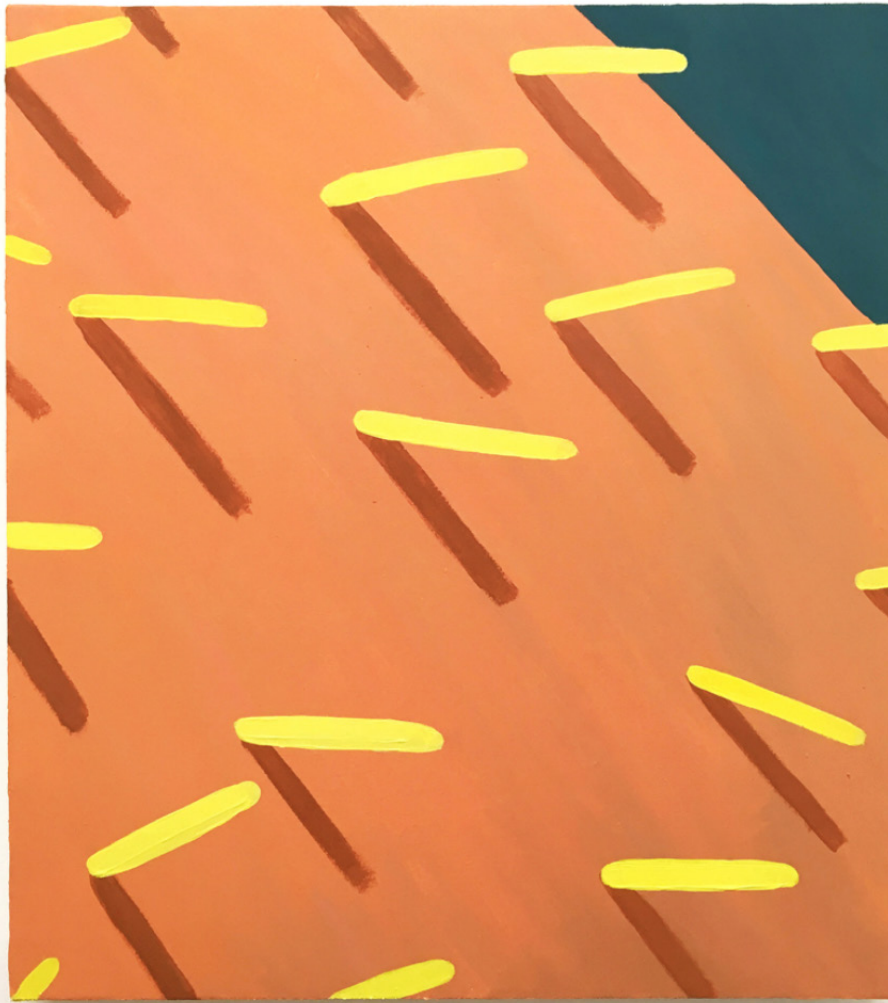
Grass #80, 2018, 20 x 18 inches, acrylic on canvas

These are successful paintings and the best part is I can't predict her next painting. I am positive she will confidently assert her paint chops, but also her wit and sense of humor. Are we placed in a field of grass? Or are we in a vortex of color? I can't know, but I enjoy trying to navigate them at any rate.