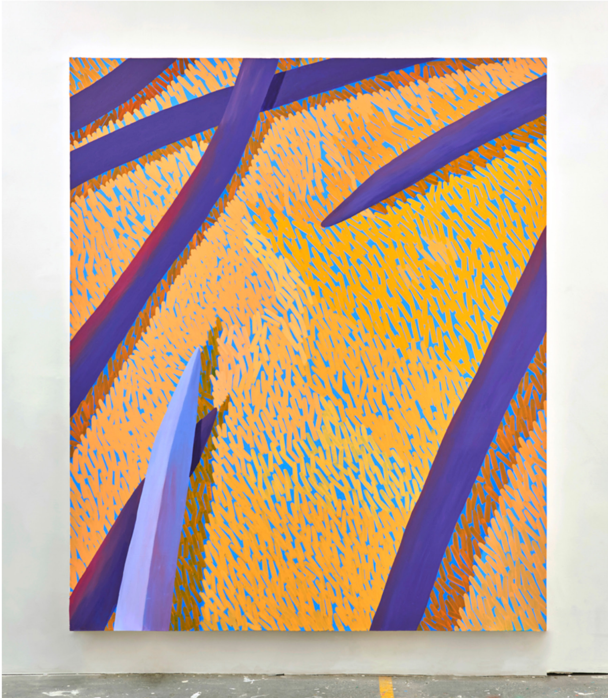
Grass #64, 2017, 84 x 70 inches, acrylic on canvas.

When I look at Corydon Cowansage's paintings two things come to mind immediately: scale & value. Although these are simple observations, the work's reach does not fall short of complex and innovative. The manner in which Corydon chooses her paint format, crops her subjects, and economically applies her paint makes her paintings about so much more than scale and value.