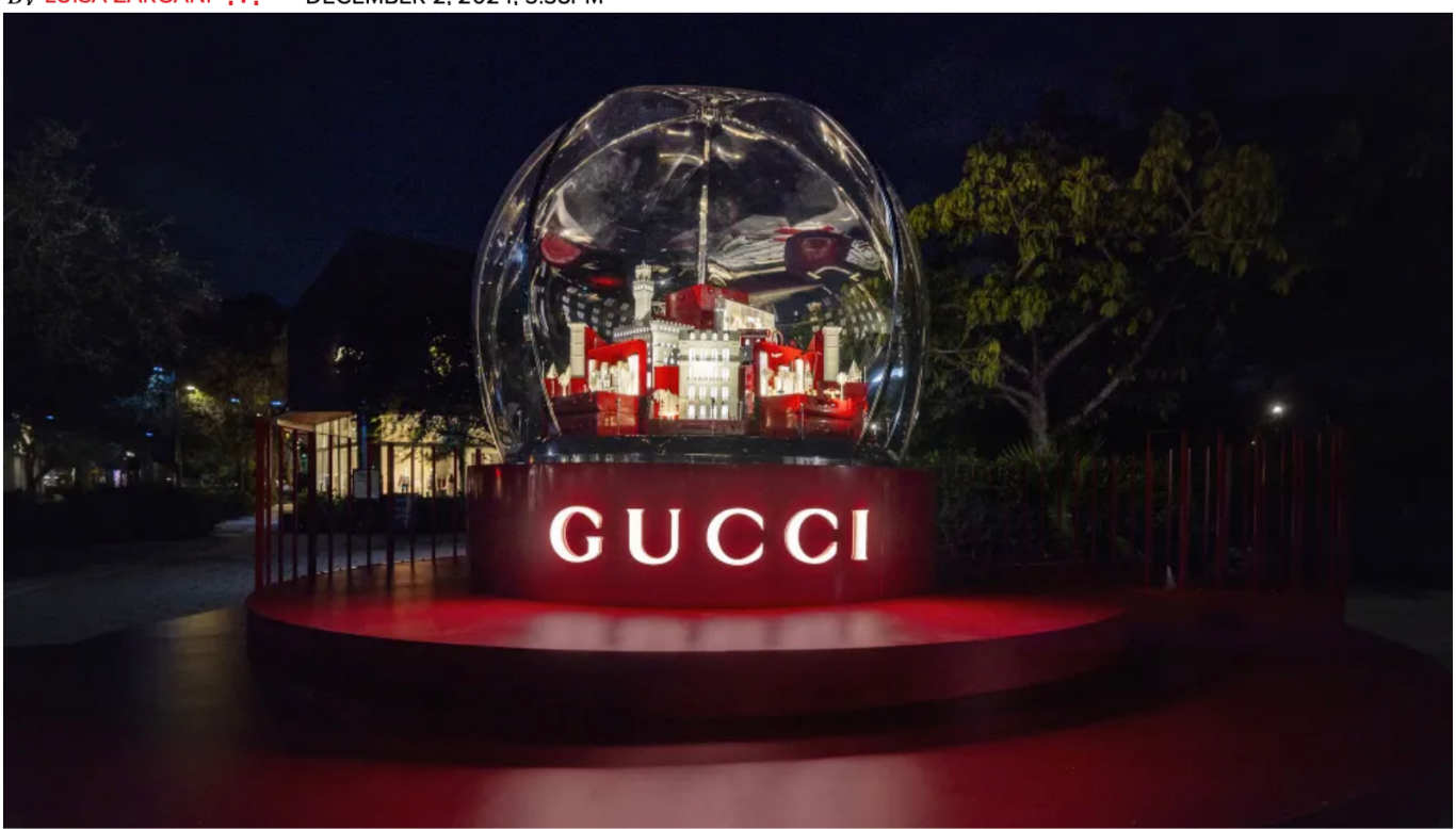
Gucci's snow globe in Miami.

HOLIDAY SPIRIT: Gucci is kicking off the holiday season with a festive installation in Miami, coinciding with the city's Art Week, which began on Monday.