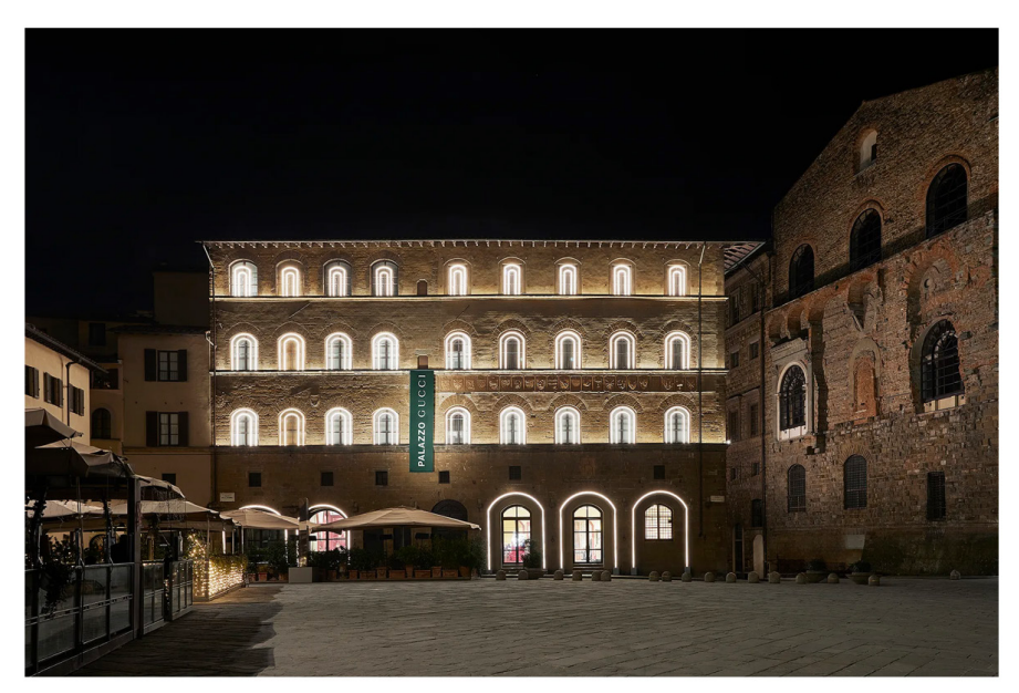
Palazzo Gucci in Florence.

Figuratively bridging its hometown and Miami, the company has illuminated the facade of Palazzo Gucci in Florence, which will remain lit until Jan. 17, coinciding with the last day of menswear trade show Pitti Uomo.